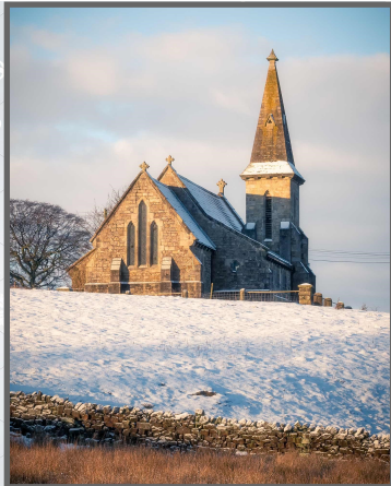
Saint Andrew's Church in the snow.