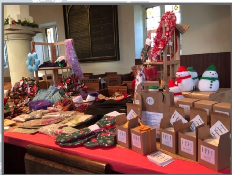
Christmas Market Stall