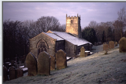
Fewston in Winter