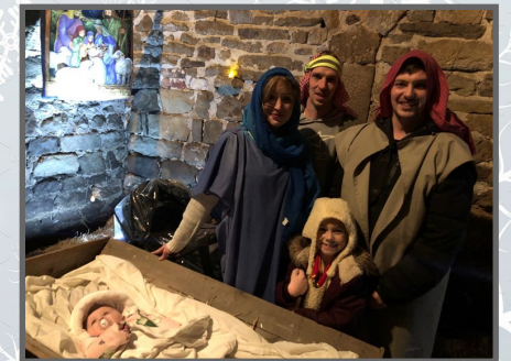
Askwith Nativity 2019