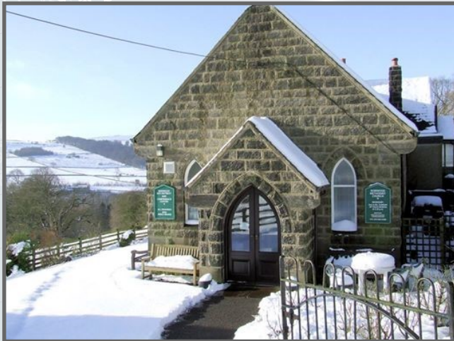
Norwood Chapel in the snow