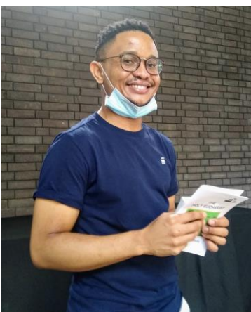
Boikanyo (Gift Aid)