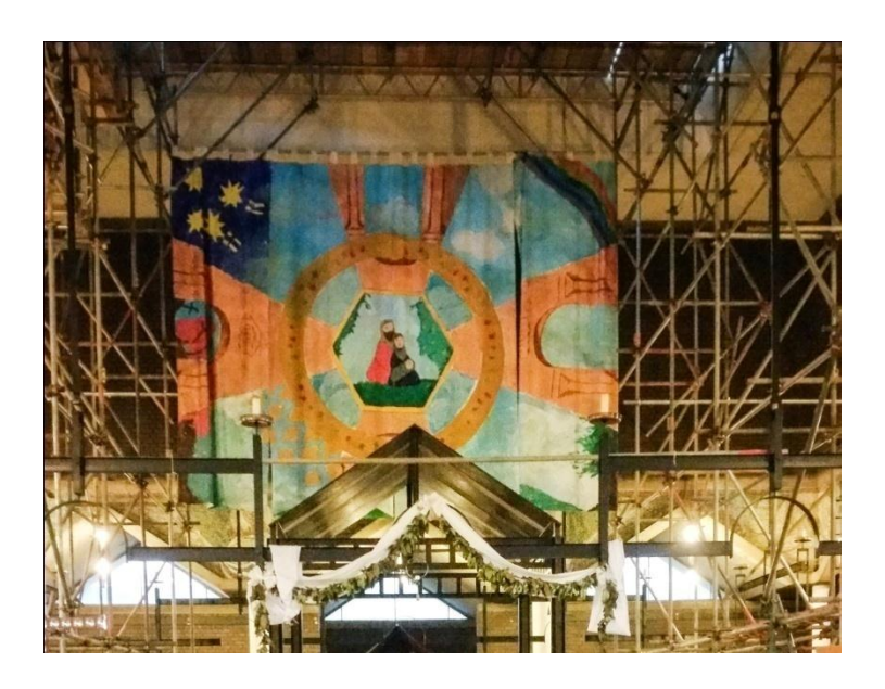
Repairs 2015 -16 with picture painted by the church school, hanging amid the scaffolding.

The material in this booklet is based on the work of Prebendary Duncan Ross For more detail on any topic, please visit www.stpaulsbowcommon.org.uk