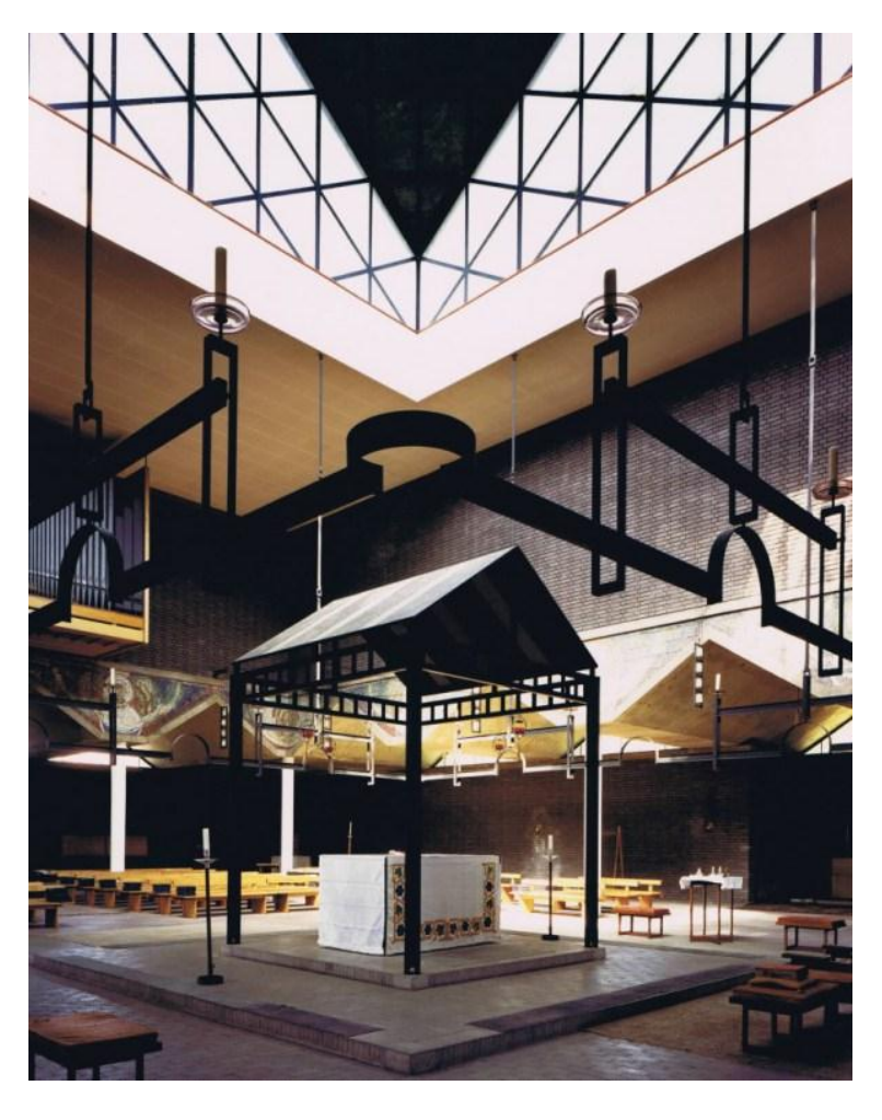
Central altar, ciborium and lantern