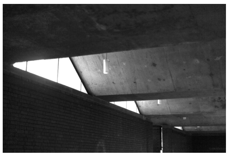
Concrete is used for the church roof

The Church is often referred to as New Brutalist. Brutalism is a movement in architecture that flourished from the 1950s to the mid-1970s. The term originates from the French word for 'raw' in the term used by Le Corbusier to describe his choice of material béton brut (raw concrete).