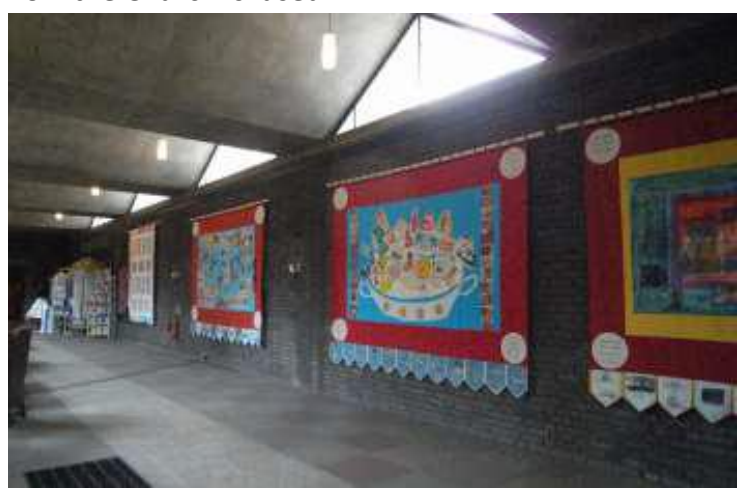
Stitches in Time tapestry exhibition

In 1998 the Victoria & Albert Museum's Shamiana , the Mughal tent Exhibition revealed the ability of this building to be more than a liturgical space.