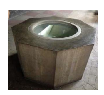
Font reflecting light from the lantern

'We were trying to build a church which would encourage true relationships in the liturgy – priest to people, people to one another, priest to God and people to God, the worship of the whole Church together. Encourage, but not cause; because it is only people coming together with understanding and faith which bring those relationships to life. '