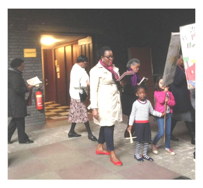
Palm Sunday procession along the brick path