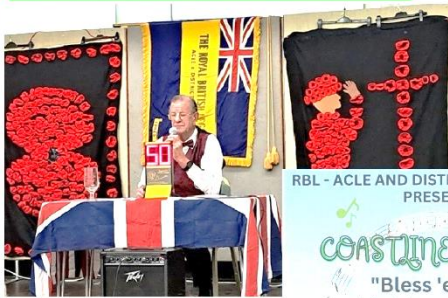
Above: Prize Bingo Night on 21st October, in Acle Recreation Centre, raising money for the Poppy Appeal.

RBL - ACLE AND DISTRICT POPPY APPEAL PRESENTS