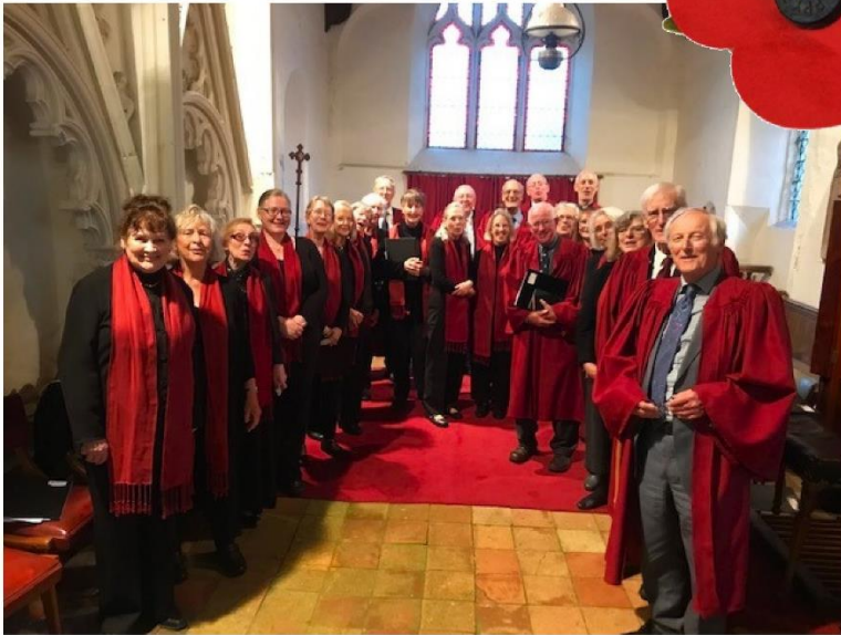
The Acle and Bure to Yare Choir preparing to sing Evensong at Wickhampton