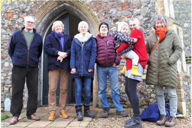
Below: Sunday 6th February - the Reedham Ringers celebrated the Queen reaching her Platinum Jubilee by ringing at Reedham Tower.