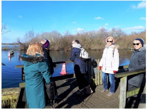
Above: A recent walk at Ranworth with Reedham and District W.I.