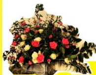
Acle Church Flowers for the 70th Anniversary of the Queen's Accession