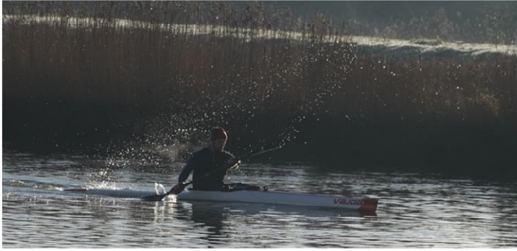
Some energetic exercise on the Yare at Reedham. (K.C.)