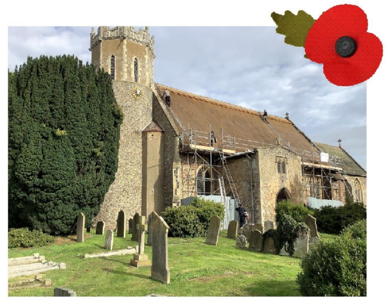
Thatchers completing the Acle Thatch repairs.

Acle: Beighton with Moulton: Freethorpe: Halvergate with Tunstall: Limpenhoe, Southwood and Cantley: Reedham: Wickhampton