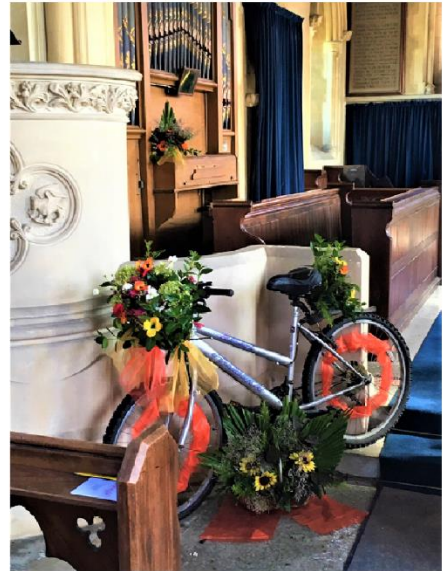
Limpenhoe Church decorated for the Historic Churches Bike Ride Day - Saturday 14th September.