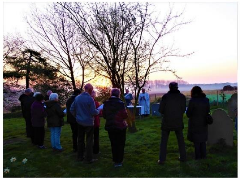
Above & below - Acle Churches Together at Fishley Church, Easter Day Sunrise