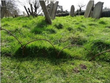
Above - Reedham Churchyard Group have put in Willow hoops to mark out some of the Conservation areas .