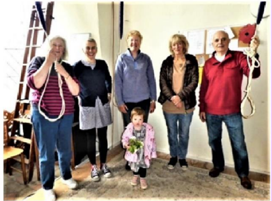
Above - Reedham Ringers greeting May Day with bells. Left - The Easter Fire is kindled - Tunstall Church on Easter Eve.