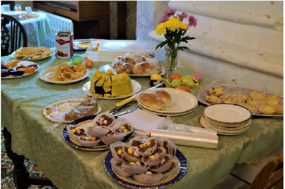
Some of the scrumptious food on offer at Beighton's 'Eggstravaganza' on Monday 22nd April.