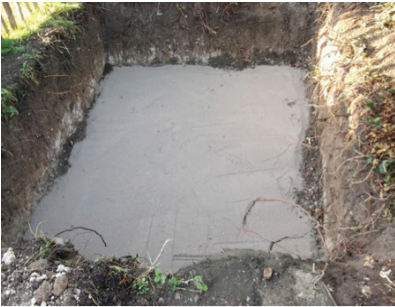
10:30 Hole dug and concrete placed