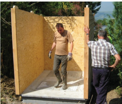
14:30 Floor down and walls going up