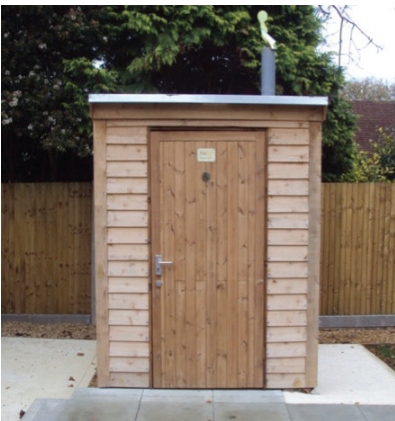
16:30 Secure and weather tight ready for finishing touches and fit out in the morning

We do not carry out the installation ourselves so our prices do not include this. Contractors with previous experience can typically install a full access toilet and standard steel or timber building in a day. We provide full installation instructions and technical assistance during installation on the phone by arrangement. On-site supervision is available at additional cost.