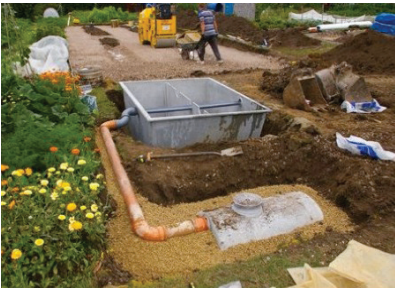
12:30 Chamber and soakaway installed and connected up