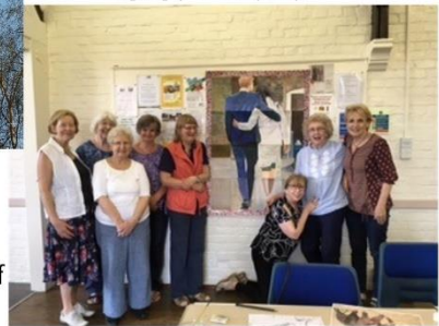
Acle Art Group and their painting - see inside!