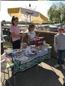
Messy Church Reedham & their Cake Stall in aid of Educare (left)

At St.Andrew's church in Wickhampton, NR13 3PB, in Broadland