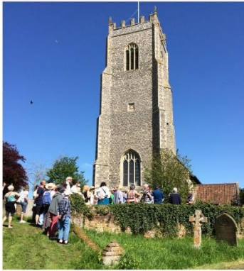
'Reedham Church & Roman Past' Guided walk -May 5th