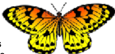
(Not a Monarch)