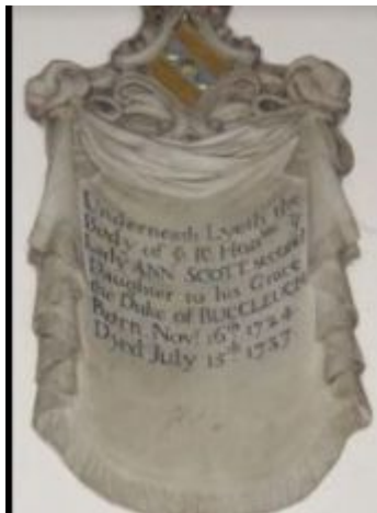
Lady Ann Scott Monument