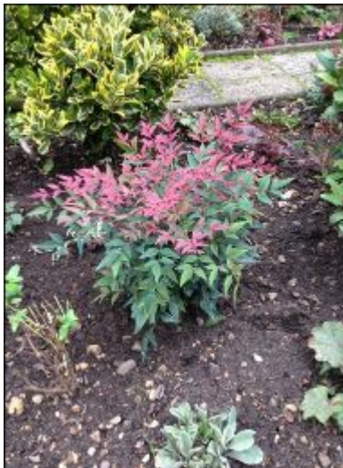
Newly Installed Plants in the Garden of Remembrance