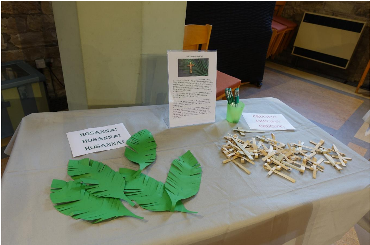
A couple more Prayer Stations set up during Holy Week.