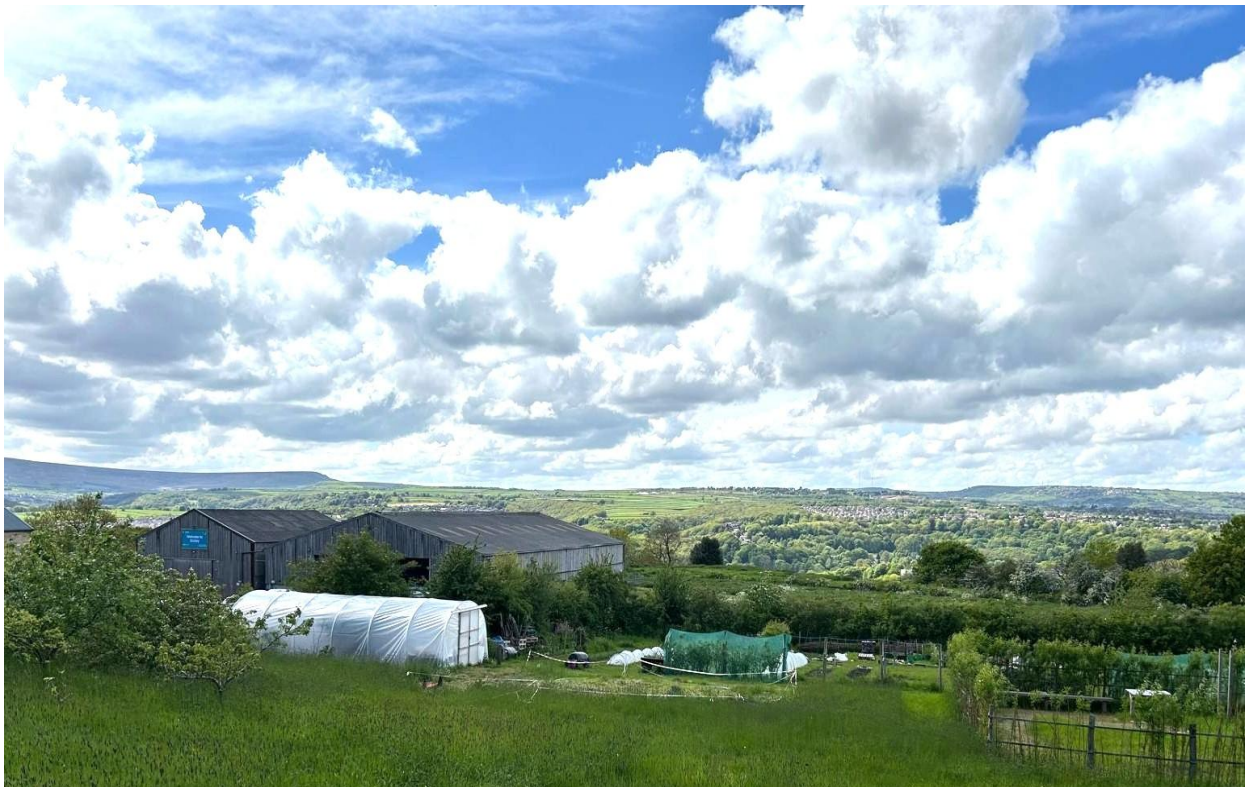
Across to the Moors from Stirley Farm