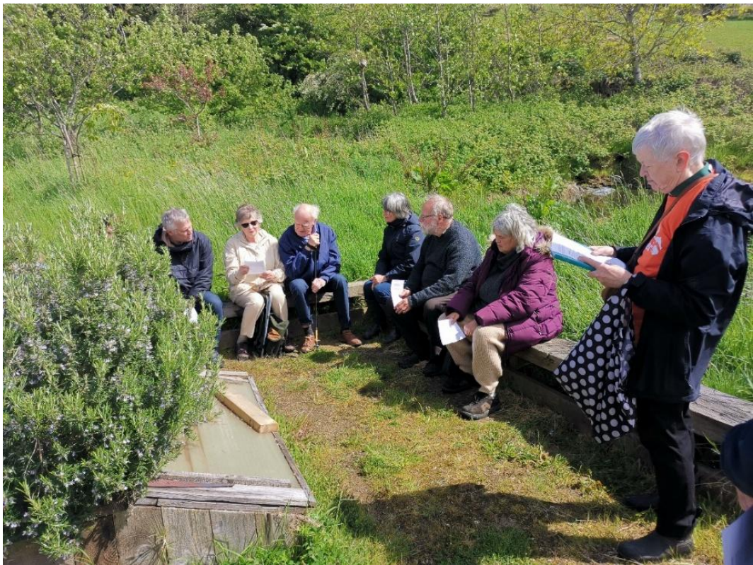
A couple of photos from the Big Blessing Service at Stirley Farm.