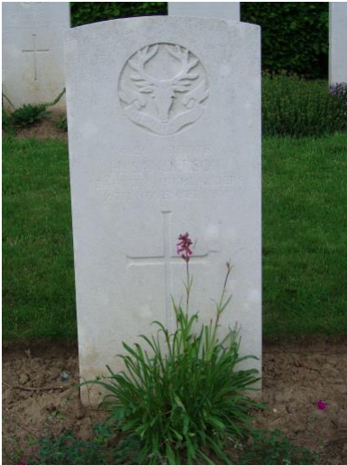
Herman Sanderson's Grave at the War Grave Cemetery Contay, France.

I was lucky to have worked in Lille in France and could visit Contay easily on the way back to Huddersfield. It still is a small village in a rural landscape. The British and Commonwealth War Grave cemetery is peaceful and surrounded by Maple trees, as the majority of the 1500 graves are of Canadian soldiers. Contay is only one of several hundred cemeteries that were in use for the relatively short period of the Somme Battle.