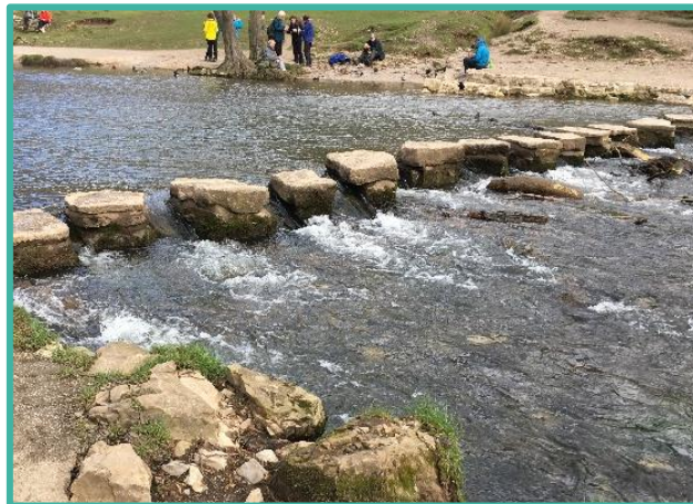
Dove Dale Stepping Stones