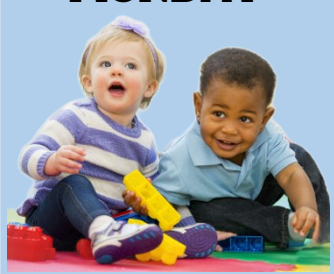
10am-12noon ARK PLAYGROUP For Under 5s and carers. £3 first child, £1 others.