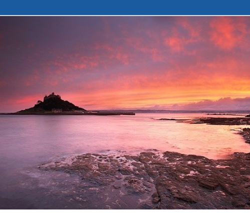
The Lord bless you and keep you; The Lord make his face to shine upon you, and be gracious to you; The Lord lift up his countenance upon you, and give you peace. Numbers 6: 24-26