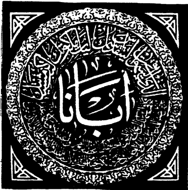
The Lord's Prayer in Arabic