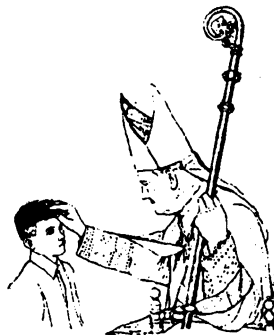
Bishop administers the Sacrement of Confirmation