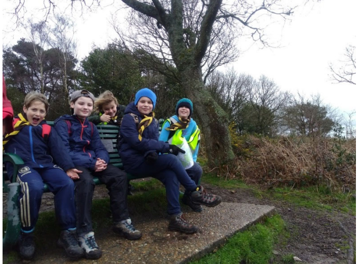
A well-earned rest on a long hike!