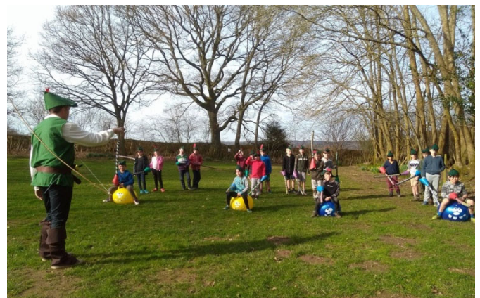
Cub camp, Easter 2018