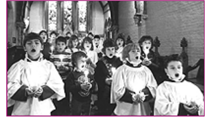
Christingle Service 1980

Later, in 1973, it was thought that by meeting earlier, more junior children might be able to come, so they started to meet at Wayside at 9.20 for the usual activities and then went over to church shortly after 10.00. The same arrangements were made for the infants and the newly formed over-eleven group, which started in 1977.