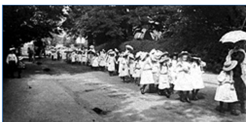
The Sunday School in 1908

Annual trips had been started in 1882 to places like Crystal Palace. Some years the trip included nearly three hundred children with the Hampton Brass Band meeting the party at the train station on their return with flags and a parade. The Sunday School excursion to Brighton in 1898 included members of the choir and Bible class and a special train was arranged with the railway company. The following year the excursion was to Southsea and the party numbered four hundred and eighty five. In 1905 it was a "River Excursion to Windsor where the boats were comfortable and well managed by civil and obliging men, and the changing scene on the banks formed a continuous panorama, pleasant and restful." During the 1930s/1940s the annual Sunday School treat continued to be an outing on the train, often to Brighton. Each year about one hundred and ten of the younger Sunday School children, the "Tiny Tots" who did not go on the outing, were invited instead to the vicarage for games and tea.