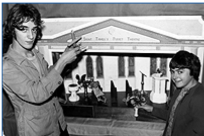
The Sunday School puppet theatre in 1969

Children at Secondary Schools also met in church for the opening worship