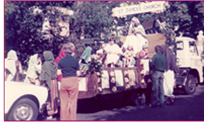
Hampton Carnival 1979