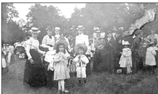
The Sunday School in 1916

The annual Sunday School winter entertainment and distribution of prizes was very popular. The February 1892 magazine reported: "There was an exhibition of dissolving views and comic scenes from the Vicar's magic lantern. It would seem that the children never tire of seeing the magic lantern, and although a great majority of the slides are shown year after year, the continuous roar of satisfaction and applause never ceased from the beginning to the end of the exhibition" . In 1898 there were about two hundred and fifty children present for this, nearly all the teachers and a fair number of parents. About forty prizes were given, consisting of Bibles, prayer books and story books. The annual prize giving in 1917 consisted of prizes and certificates, numbering 210, to the boys, girls and infants attending the Sunday School, with the February 1917 magazine reporting: "There was a large gathering of parents and friends. After the distribution a short Lantern Entertainment was given, and each child on leaving the room was presented with a bun and orange."