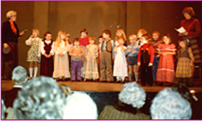
Jubilee Concert 1977

primary to secondary day school. This older group met for opening worship with the juniors in church, but then proceeded to the vestry to prepare for confirmation and communion. After a year these children would attend Parish Communion regularly, receiving their final instruction for confirmation in weeknight classes. The Sunday School for the younger children living at a distance from the church in the Hanworth Road and Rectory Grove area of the parish continued to meet in Rectory School. However when there was a monthly Family and Parade Service, a shorter, simpler service at 11.00 , usually on the fourth Sunday, none of the Sunday Schools met.