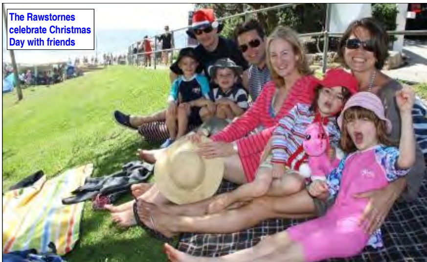
The Rawstornes celebrate Christmas Day with friends