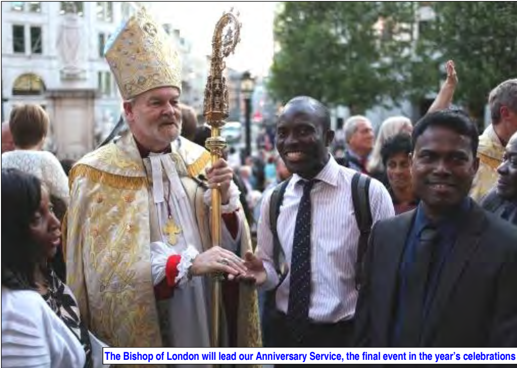
The Bishop of London will lead our Anniversary Service, the final event in the year's celebrations

The year 2013 has been one to remember at St. James's. Throughout the year — indeed since the 2012 Christingle Service on 2 December — we have had a series of events. As the year comes to a close, I am looking back at our motivation, what we did, and what we may hope for when we consider the future.