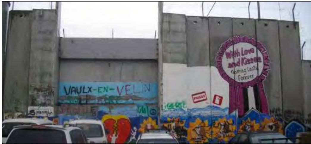
'O little town of Bethlehem, how still we see thee lie...'

H owever 'little' Bethlehem was in Jesus Christ's day, it is not so little now! With a population of around 25,000, Bethlehem is located in the area under the jurisdiction of the Palestinian Authority of the Occupied Territory of the West Bank.