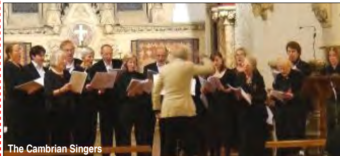
The Cambrian Singers

of one of the Canadian war dead, and of three of those whose names are on the war memorial, from the First World War.