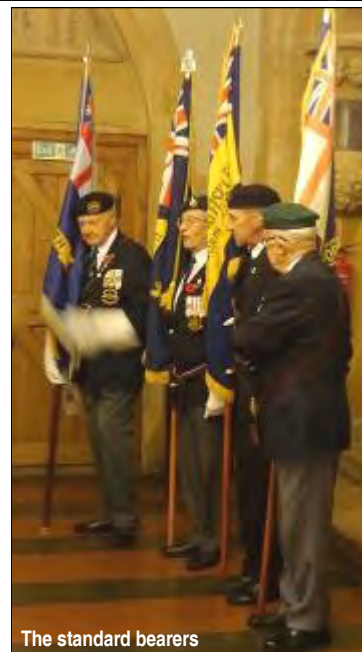
The standard bearers

This evening was appreciated by ex-service personnel present, but also by others who still wish to say: We will remember them.