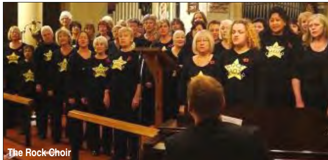
The Rock Choir

ON NOVEMBER 8 , the Friday before Remembrance Sunday, two choirs, a TV presenter, a senior official of a military charity, a trumpeter, an organist, and four standard bearers gathered at St. James's Church for a Festival of Remembrance.