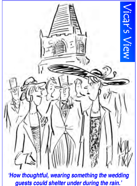
'How thoughtful, wearing something the wedding guests could shelter under during the rain.'

As part of our 150th celebrations, this lunch is in aid of the Voluntary Care Group. Come with friends, make new friends. Tickets are £15 for two courses and a glass of wine, available from the Parish Office.