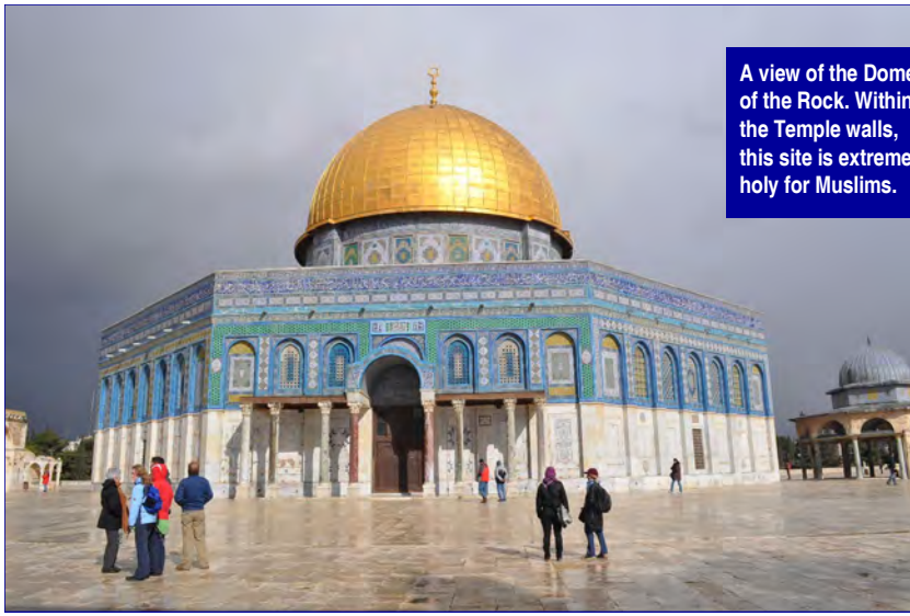
A view of the Dome of the Rock. Within the Temple walls, this site is extremely holy for Muslims.