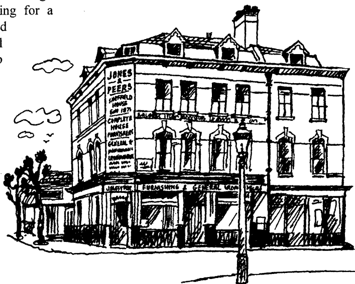
The building as it was c. 1900

In addition to the very varied selection of art for sale, the Gallery offers a quality comprehensive picture-framing service and will also supply mirrors to any size and in any frame - there are over 500 to choose from! There are prints of local views and a fascinating selection of cards - just the place to go if you are looking for a more unusual card for a special occasion. Do go in and browse!