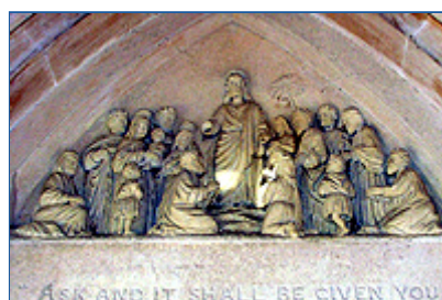
'Ask and it shall be given you' at the west end of the south aisle above the outside south door