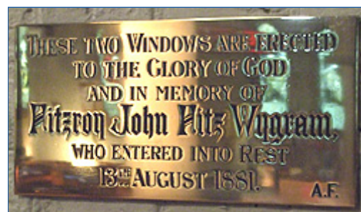
Plaque in memory of Fitzroy Fitz Wygram 1882