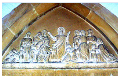
'Suffer Little Children To Come Unto Me' at the west end of the south aisle, above the inside south door