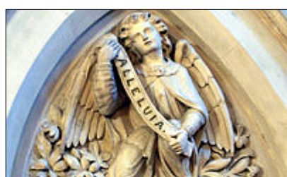
'ALLELUIA' at the east end of the south aisle above the vestry door