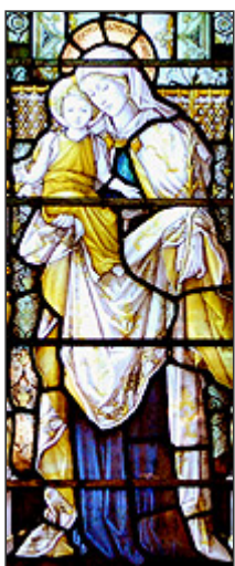
'St Mary, Mother of the Lord'