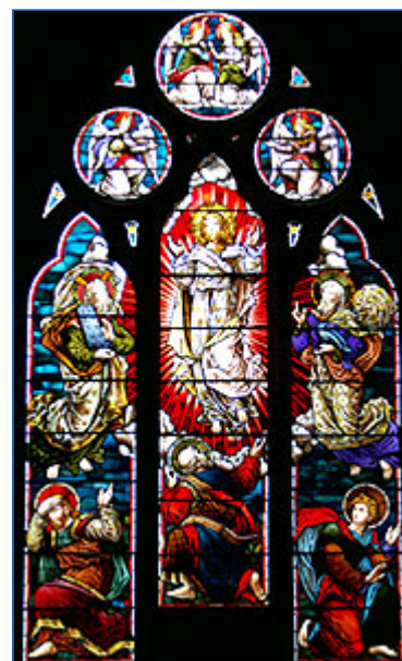
'The Transfiguration of Christ'

The windows in the north aisle were originally plain glass and were later replaced by ones in stained glass, dedicated to parishioners who were well known at the time. The first double window (east end) representing 'David Rex' and 'Sancta Cecilia' was installed by