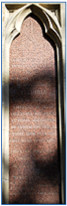
The foundation stone

Back in 1885 the magazine reported; "We must not forget the unfinished state of our Church, and that there is still wanting the Tower and Spire, a Peal of Bells and a Parish Clock. The only funds hitherto set apart are the proceeds of the sale of honey produced in the Vicarage garden. This amounts now to £8 12s. 0d."