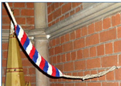
Baptistry bell rope

Parts of the tower needed re-pointing in 1920 and there were several outbreaks of dry rot in the tower, the one in the fifties causing extensive damage to the floors at the east end, and another in the early sixties.