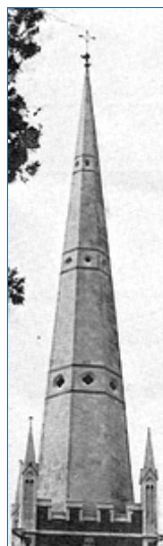
Cross and weather vane on the top and missing cross on pinnacle

In December 1940 a British Wellington bomber, the crew of which had bailed out when their plane had become uncontrollable due to icing, crashed on to No 63 Park Road, the home of Lady Stanton. The tip of the plane's wing knocked off one of the crosses from one of the four pinnacles at the base of St James's spire. (See the picture on the near right where the right hand cross is missing.) After a parish-wide collection, much needed repairs to the clock and spire were undertaken in 1947. The spire had been badly shaken during the bombing in the war and steeple-jacks set to work making good the damage. (See the picture on the far right.) At that time the spire still supported the original cross and weather vane (see left). It must have been removed some time between then and the 1989 spire renovation because at that time the 'new' cross was taken down, repaired, re-coated with glass fibre and resin, and refixed in a new capstone by the steeplejacks.