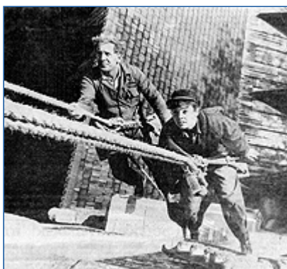
The steeplejacks up the spire

The church clock had to be stopped on 7th September 1970, when it was found that the bottom pulley anchorages of the driving weights, which total nearly half a ton, were affected by dry rot. A preliminary inspection in 1970 showed that some repairs were needed to the spire stonework, lightning conductor, and weathervane, and that the upper brickwork of the tower needed extensive re-pointing. Strong wire-mesh was put up on all openings in the tower in 1956 to stop the pigeons coming in.