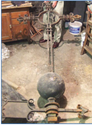
The original cross and weather vane