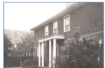
The new vicarage was built in 1937 after the old, rambling and uneconomical vicarage was demolished. The new one was more suitable and is still in use today.