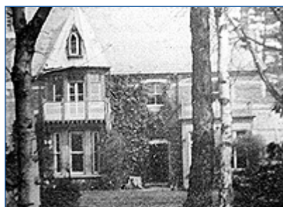
The old vicarage, built in 1864 next to the church, was a large, elegant, gabled, typically Victorian one. It cost almost as much as the church itself.