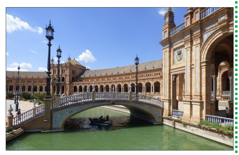
Seville's Plaza de Espana, part of a city that has plenty of surprises for visitors