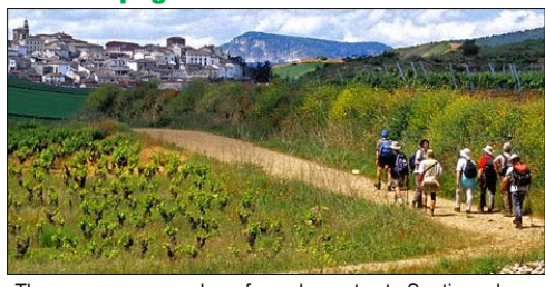
There are now a number of popular routes to Santiago de Compostela – all may be described as part of the Camino de Santiago – the most popular is from the French side of the Pyrenees. It is a Unesco World Heritage Site.