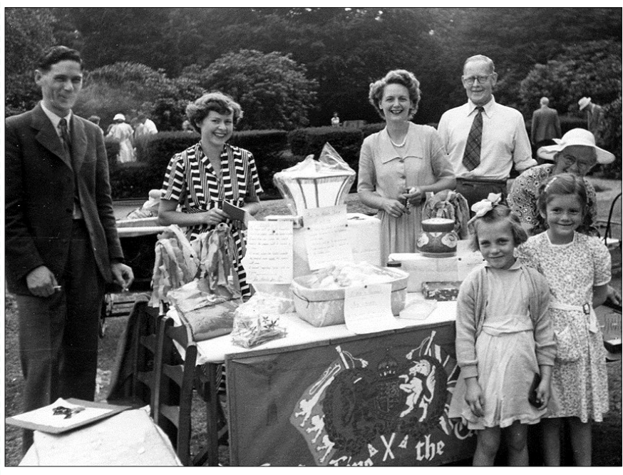
All the fun of the fete... St James's Day has always been a day to celebrate friendships