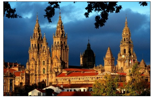
From the 11th century it became the centre for pilgrimage, perhaps the greatest of the medieval period.

A 12th century tradition suggested that James had preached in Spain before his martyrdom. Then it told how his body had returned from Jerusalem to be enshrined in Santiago de Compostela, in NW Spain.