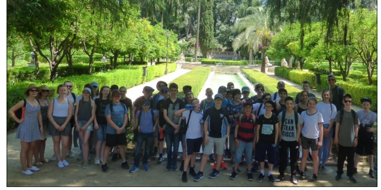
Enjoying some shade in the Parque de Maria Luisa. I'm eighth from the left!

On the final day we visited the 14th century Alcazar Palace, which had stunning halls and galleries with mosaic tiles and golden-domed ceilings. A boat trip down the River Gualdalquivir past the Tower of Gold was a great way to end the trip.