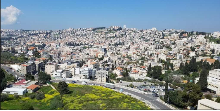
Modern-day Nazareth, but an isolated village in Jesus' time