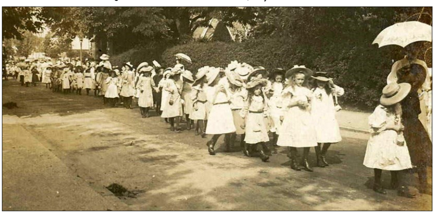
Daisy chain... the Sunday School children parade in their flowery bonnets in 1908

Then, they scattered in all directions to watch or