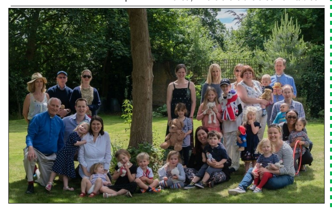
Lots of fun at a Teddy Bears' Picnic held in the vicarage garden on 4 June

Other improvements to the church include a sink in the vestry, power sockets in the south aisle, and extra storage cupboards in the children's area, where there are also new tables.