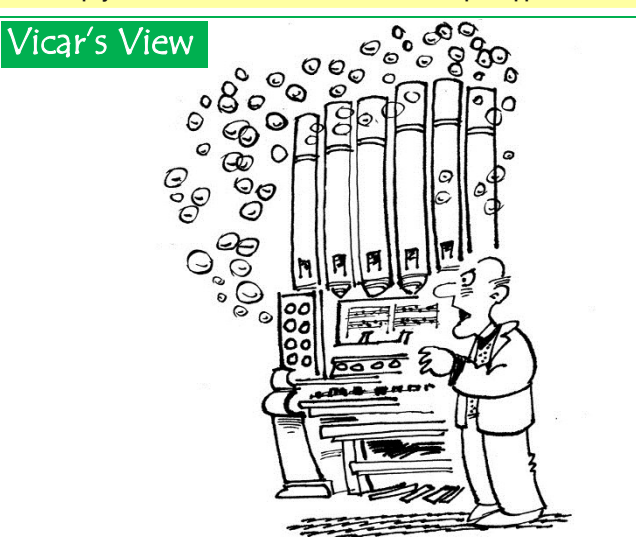
'I won't ask again, which choir member put bubble mixture in the organ blower?'

If you are a regular reader please consider making an annual donation. Cheques should be made payable to The PCC of St James and sent to Spire Appeal c/o the Parish Office.