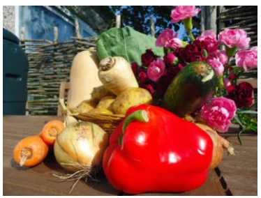
CHECK OUT OUR WEBSITE