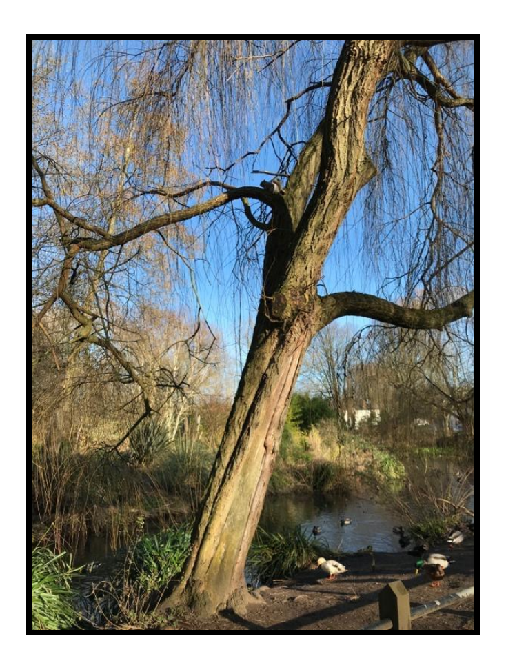
The magazine for the Parish of Cray Valley