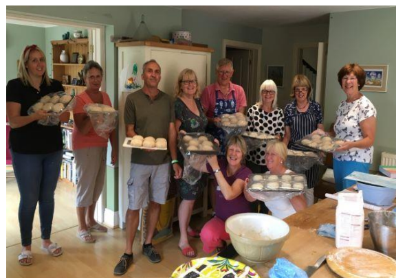
Lamas day Bread making

Our works priorities stem from the Quinquennial Report (the report highlighted that the church is in generally good repair, but some costly work has been identified) and support for some refurbishment of the Parish Hall, with a community working party of volunteers. We have started grant applications and fund raising for our churchyard wall, engaging the expertise of one of our church warden's. We have secured £6,500 of the £16,500 needed to date and seek to achieve the remainder through further grant applications.