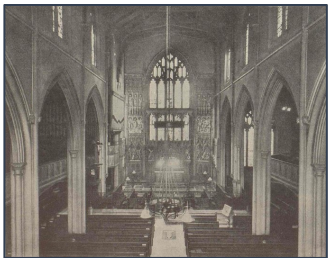
St Andrew's in Wells Street.