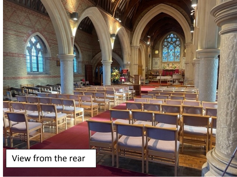
View from the rear