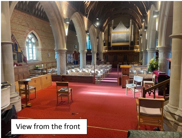
View from the front