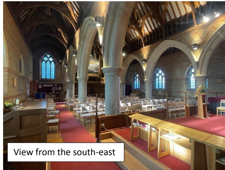
View from the south-east