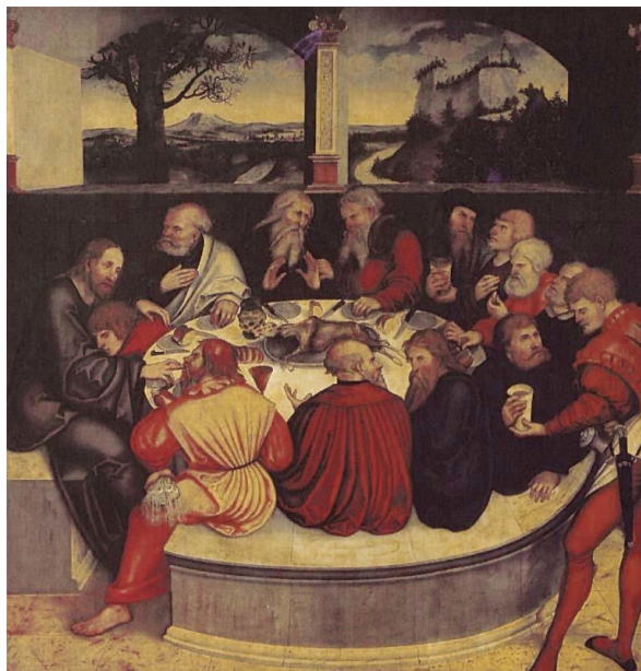
The Wittenberg Altarpiece