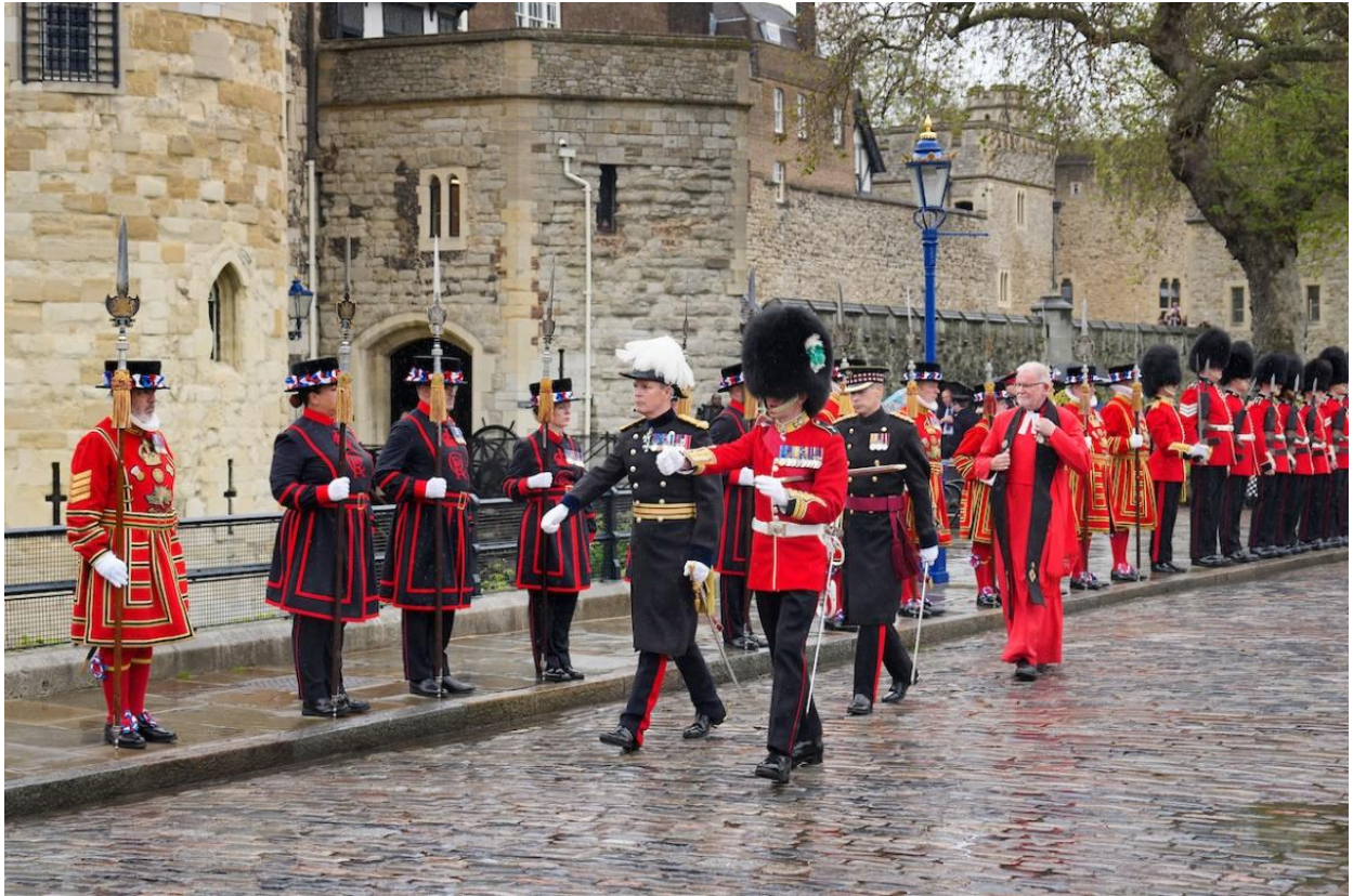
Lt General Sir George Norton

A gun salute fired by the HAC Regiment - Honourable Artillery Company - marked the Coronation. The Yeoman Warders and Tower Guard marched out, accompanied by members of the Welsh Guards. The HAC Band also performed and the ceremony was supported by the HAC Pikemen and Musketeers and the HAC Light Cavalry.