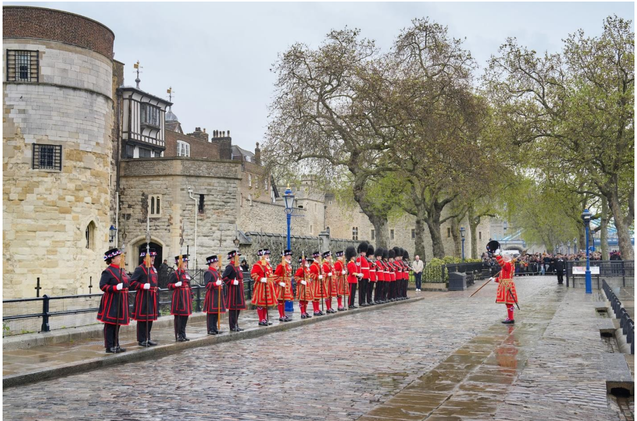
The Yeoman Warders