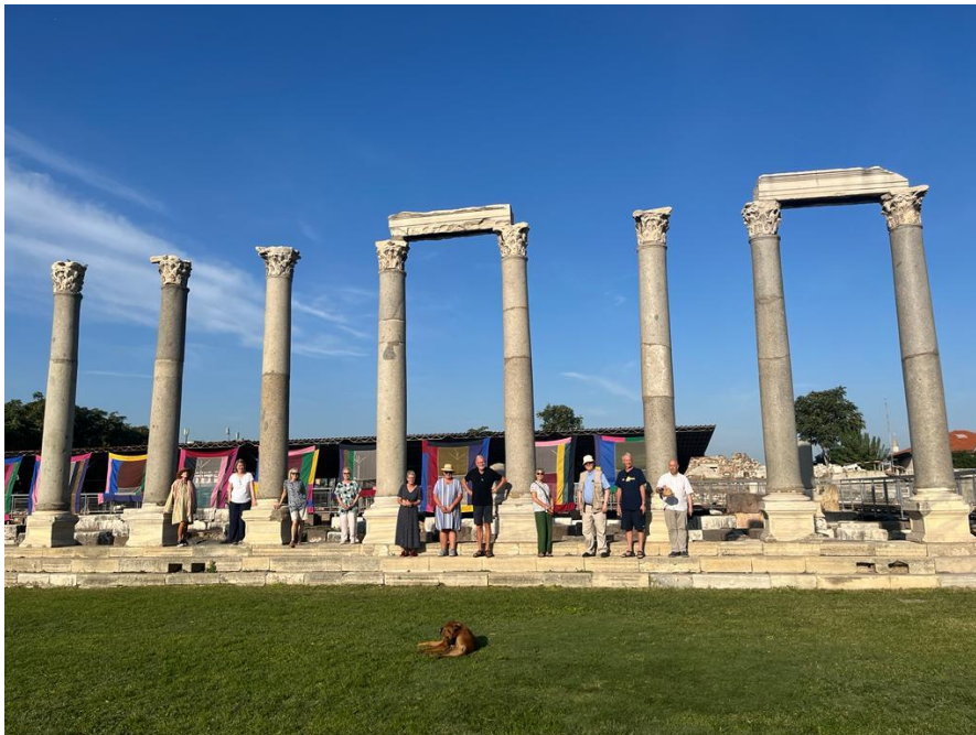
In the Agora at Izmir (Smyrna in the Bible)