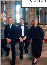
The Linarol Consort