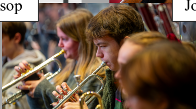
Chetham's School of Music