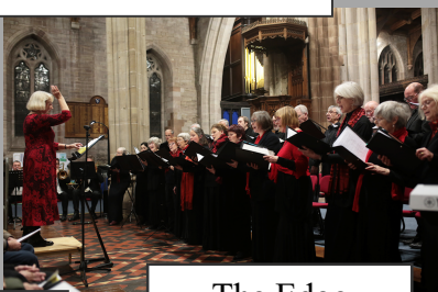
The Edge Chamber Choir