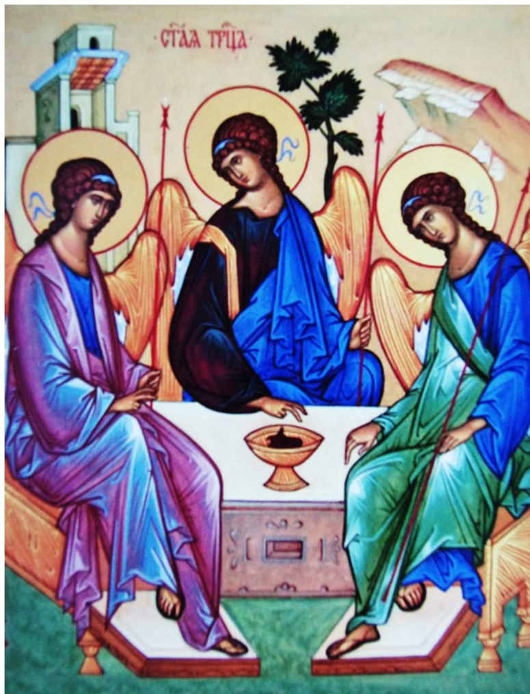
Icon of the Old Testament Trinity after Andrei Rublyov

The three angels look alike – neither the Father nor the Son are depicted as we usually expect as bearded men. Rather the figures are depicted in the way angels usually appear in iconography - as young men with long, curly hair pulled back, no beards, and delicate gold wings.