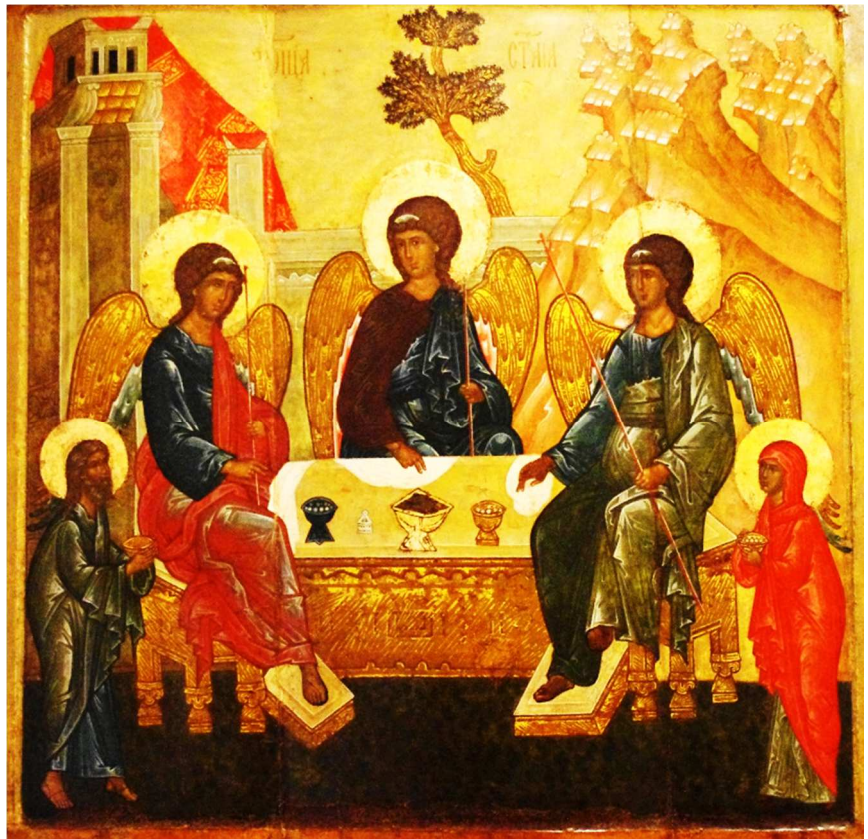
Icon of the Old Testament Trinity, Yaroslavl Art Museum

Although God the Father was, and sometimes still is depicted as a distinct figure, the Russian Orthodox Church finally forbade the depiction of God the Father at the Great Synod of Moscow in 1667. As the canons of the Russian Orthodox Church state "It is most absurd and improper to depict in icons the Lord Sabaoth (that is to say,