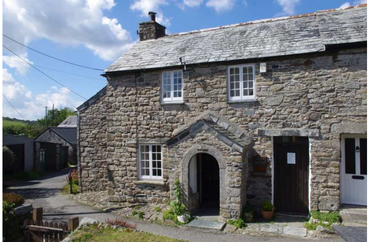
Wesley Cottage, Trewint

When we go to Cornwall to visit my father-in-law we usually travel by train. Occasionally, when we want to make our stay a short holiday, we drive so that we have the car available for trips out whilst we're there. It's a long drive, so we like to stop somewhere interesting en route to break up the journey. Coming back from our trip in late August we decided to stop at Wesley Cottage at Trewint, just off the A30, 8 miles west of Launceston. Personally, I was blissfully unaware of the existence of the cottage until Sue suggested we stop there on our way home. It seemed an excellent idea, so on a bright sunny day as we headed out of Cornwall, we turned off the modern A30 onto one of its old sections which is now just a loop giving access to Trewint, Five Lanes and Atarnun, in search of the cottage.