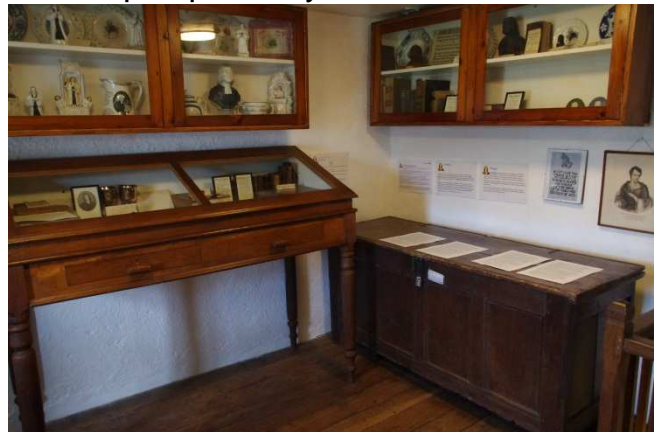
Prophet's Chamber: upper room

At the moment, funds are being raised to improve the facilities at the cottage and in particular upgrade the exhibition room to be a 'proper' education room – one of the aims is to encourage more school parties to visit. Once upgraded, the Cottage can apply for recognition from the Museum Association, which would then improve access to grant funding in the future.