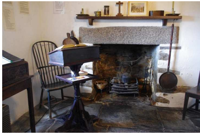
Prophet's Chamber: the chapel

About 3,000 people a year and quite a few school parties visit the cottage and it is also used for study days and retreats. Not surprisingly, there's only so much to see as it's only a small cottage. From the room where you are greeted, you can upstairs to an exhibition room. When we were there this had displays about the work of Forces Chaplains during the First World War and also information from the Methodist Peace Fellowship reminding us of the need for continuing work towards world peace. After you come back down, you pass along a stone-walled passage to the two small rooms of the 'Prophet's Chamber'. This consists of two rooms, one up, and one down. The lower room is a small chapel, probably the smallest Methodist chapel in the world, atmospheric and furnished in eighteenth century style. The upper room, where preachers used to sleep contains a small exhibition of Methodist memorabilia – items of Wesleyana, letters and some possessions of the Isbell family including a family Bible, a portrait and a class ticket. Across the road from the cottage and through a gate, is the 'Pilgrim's Garden', a quiet place to rest and pray awhile before continuing your journey.