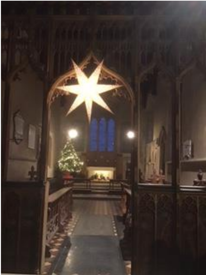
The Chancel - St Lawrence's Church, Harpley Christmas 2020