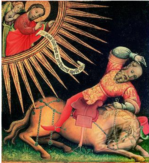
Conversion of Saint Paul, (Artist Unknown) From Lower Saxony Landesmuseum, Hannover, Germany