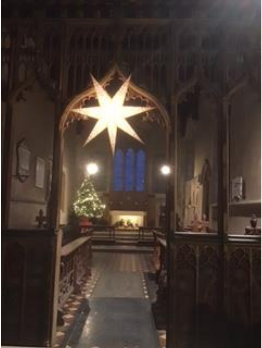
The Chancel - St Lawrence's Church, Harpley Christmas 2020