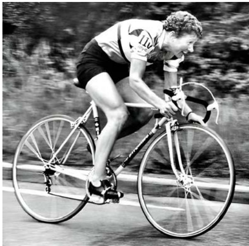
Beryl Burton, a Yorkshire Champion dominating a time-trial.