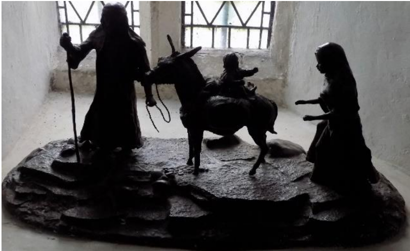
The Flight to Egypt - Breamore Saxon Church, Hampshire