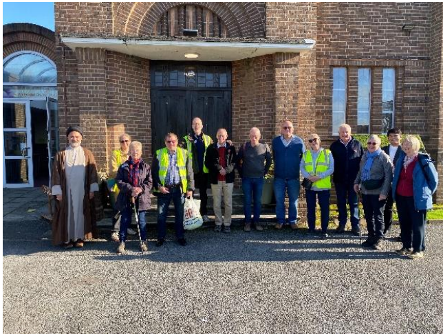
This year's Pilgrims outside Byfleet Methodist Church

We started at Byfleet Methodist Church where there were short talks about the origins of Methodism and the Byfleet church.