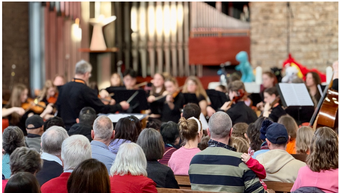
This month we had the pleasure of hosting the Apollo Youth Orchestra @ St. Michael's Church for a truly Roarsome Recital of John Williams - Jurassic Park. Selling over 180 Tickets for Charity! 🦖

Every Sunday apart from the 2nd Sunday of every month when we will all stay together for the Celebrate Multi-Generational Service.