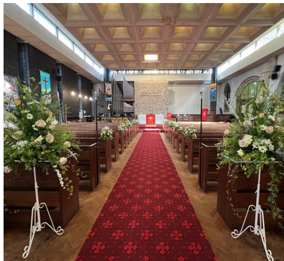
Here is some of the amazing work that the Flower Guild have done for weddings in the church over the last year.