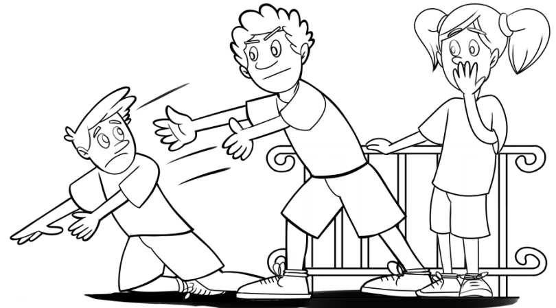
The bullies on the playground are mean to you.