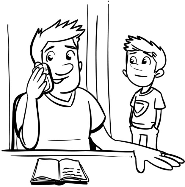
Your dad gets a call that he is getting fired from his job.