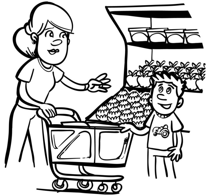
You get lost from your mom in the grocery store.