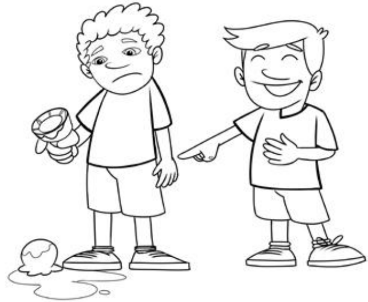
You dropped your ice cream on the floor.