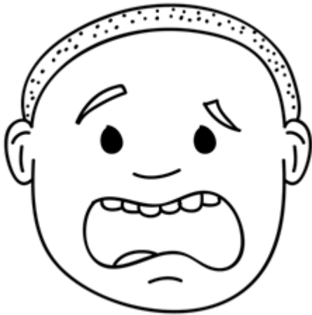
You have a bad dream that makes you scared.