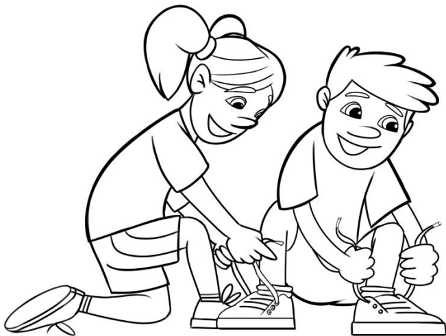
You have trouble tying your shoes by yourself.