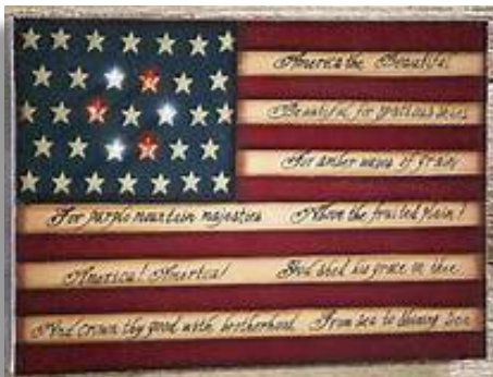
American Flag Only 33 States circa 1861

In the days and events following Tyng's death, these final words were invoked several times to all who had been inspired by him.