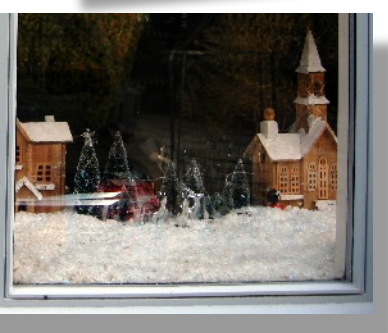
To view these images online and in colour visit www.burtonchurch.org.uk